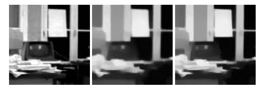
Fig. 1. Left: Original image, 93 \times 93 pixels. Middle: TV diffusion with standard explicit scheme, where TV diffusivity is regularised with \varepsilon = 0.01 , \tau = 0.0025 , 10000 iterations. Right: TV diffusion with 2 \times 2 -pixel scheme (20) without regularisation of diffusivity, \tau = 0.1 , 250 iterations