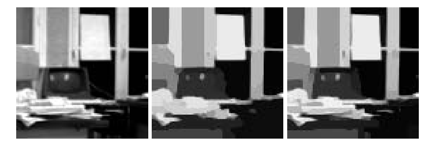
Fig. 3. Left: Original image, 93 \times 93 pixels. Middle: Balanced forward-backward diffusion with standard explicit scheme, \varepsilon = 0.1 , \tau = 0.0025 , 160000 iterations. Right: 2 \times 2 -pixel scheme (20), \tau = 0.1 , 4000 iterations

diffusivity, a high number of iterations is needed for reasonable \varepsilon . It can be seen that the 2 × 2-pixel scheme and the unregularised TV diffusivity which cannot be used in the explicit scheme considerably reduce blurring effects caused by the discretisation.