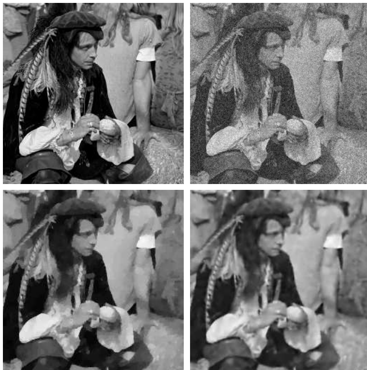
Figure 2: Top: Original image of size 256 \times 256 with values in [0, 255] and noisy image (Gaussian noise with standard deviation 25). Bottom: Reconstruction via the Rudin-Osher-Fatemi model (21) and regularization parameter \lambda = 25 (left) and model (24) with \lambda = 15 (right).

We see that our method C-PG outperforms all other algorithms if moderate accuracy is required. If we use a more restrictive stopping criterion, CP-II and PDHG have advantages and for the harder problem with \lambda = 50 also FISTA and CP-I are faster. Note that FISTA now performs much better compared to what we have seen in Subsection 4.1 whereas BB-PG is less efficient for this experiment.