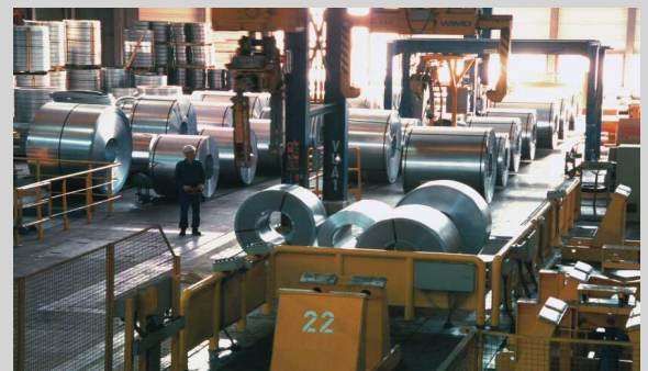
Sequencing transportation requests for slabs in the steel industry (cooperation with PSI AG and MATHEON Project B8).