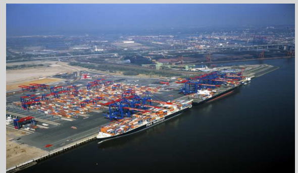
Assignment of transportation requests to automated guided vehicles in the Hamburg harbor (cooperation with Hamburger Hafen and Logistik AG and MATHEON Project B8).